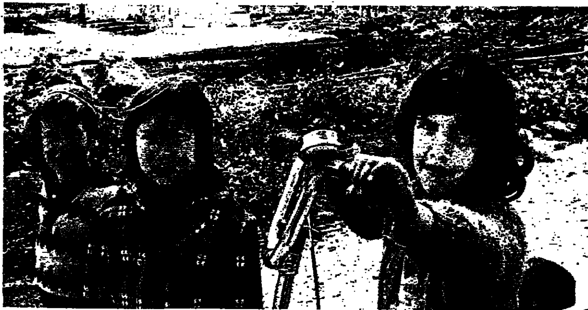
Early settlers in 1977

Counsel did not argue that the petitioners had no standing before the court, but she asked the court to consider whether it would assist the petitioners in what had become a public political issue.